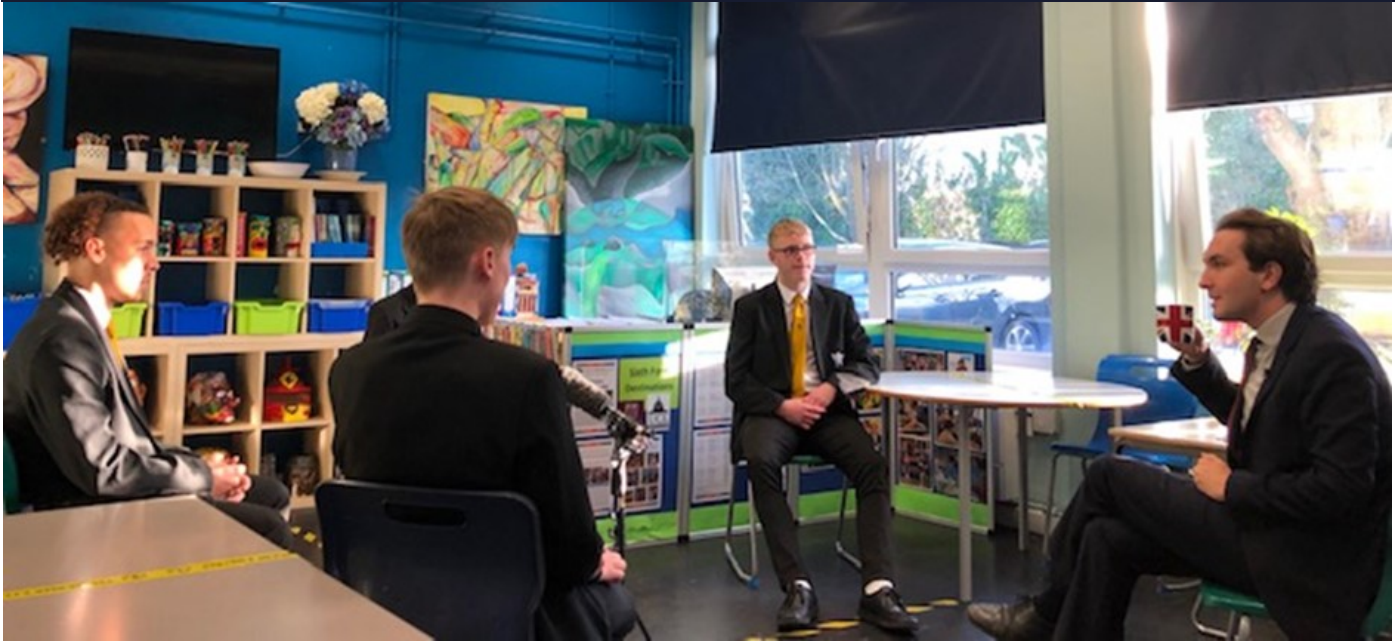
Newsnight journalist Lewis Goodall discusses the cancellation of public exams with Year 11 students

Early last week, Prime Minister Boris Johnson announced the closure of both primary and secondary schools across England as part of another national lockdown to quash the spread of corona virus. Whilst many schools have, in practice, remained physically opened to children of critical workers and teachers now juggle the demands of delivering remote learning to the majority of their class whilst other students are also present in the classroom, it was decided by the Government that, once again, GCSE and A level exams would be cancelled this summer.