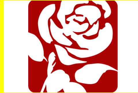
THE LABOUR PARTY